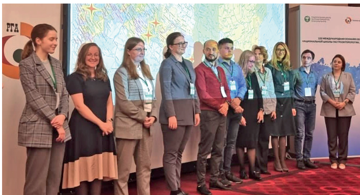
Fig. 1. Participants of the First Russian Gastroenterology Olympiad